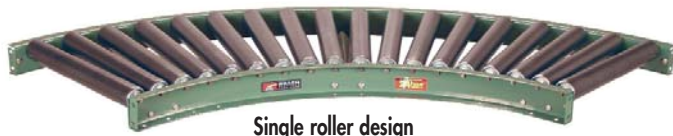
Single roller design