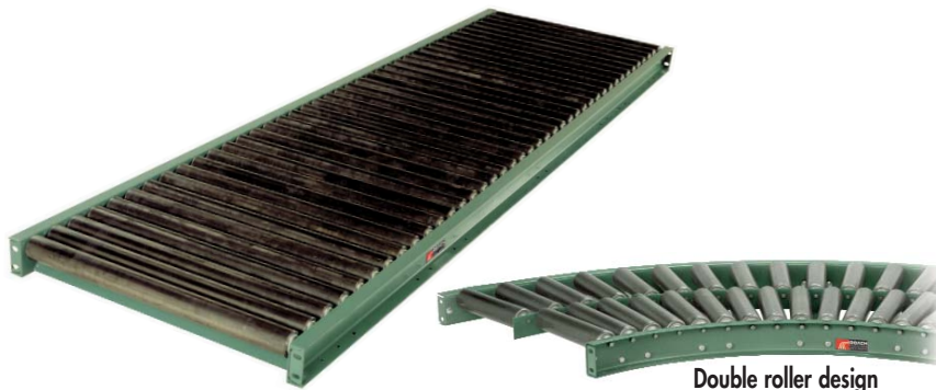
Double roller design

24 HOUR SHIPMENTS INCLUDE ALL 1-FOOT INCREMENTS 1'-0" TO 10'-0" ON STRAIGHT SECTIONS