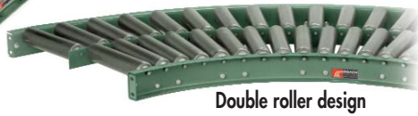
Double roller design