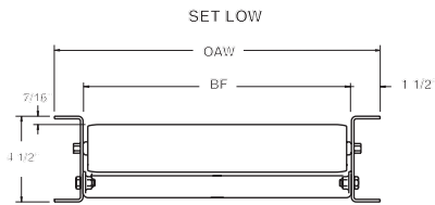
Single roller design